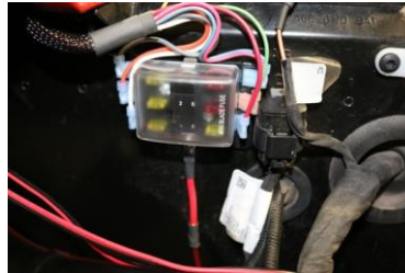
Mount Fuse Box

STEP 3 Mount Fuse box on fire wall near factory barrier strip as seen above.