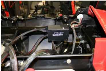
Mount Control Box

STEP 2 Mount the power control unit on the cross bar under the dash with included self tapping screws