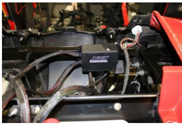
Mount Control Box