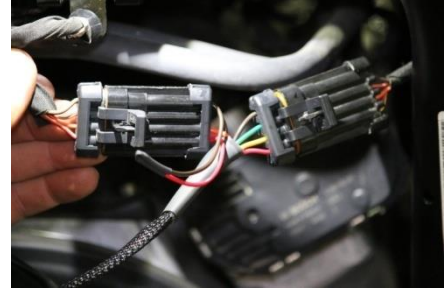
XTC Harness connector installed