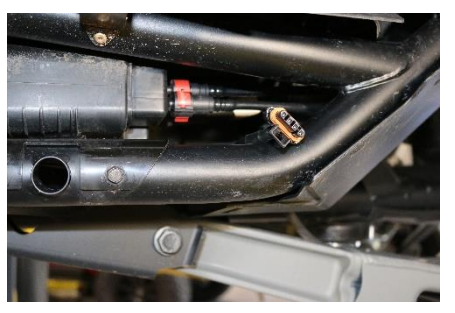
Run along the left side frame from the rear to the front left fender where there is an opening into the dash.