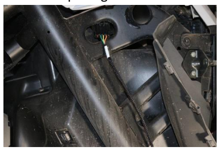
Open the Dash storage and remove the tray, run the harness up into the compartment from the fender.